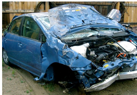
Recalled Toyota Prius

Toyota's recall is the latest example of a large corporation placing its economic interests ahead of its customers' safety. Instead of protecting its consumers from these deadly defects, Toyota has consis-